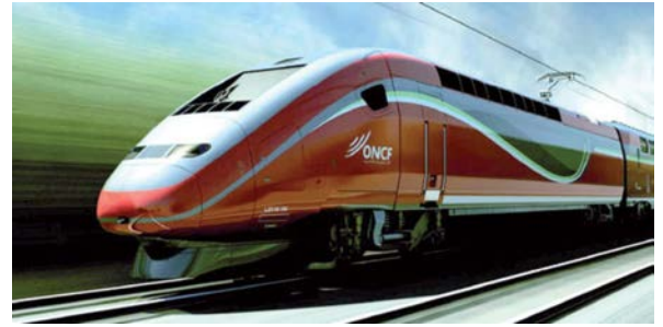
Alboraq High Speed Train

This morning, our luggage is safely transported to our Marrakesh hotel while we step aboard the Alboraq high-speed train . This, the fastest train in Africa, is a marvel of modern engineering as it carries us through captivating landscapes toward Casablanca's Voyageur Central Station. Here we change to a different train, comfortable in our first-class seats enroute to Marrakesh. Arriving in mid-afternoon, we take a panoramic bus tour of this very vibrant city before settling into our beautiful hotel, Al Fassia Aquedal . This is a boutique hotel designed as a 'riad'—a type of traditional Moroccan dwelling with Andalusian interior courtyards. This evening we enjoy dinner at one of the highly rated restaurants in the hotel. Lodging: Al Fassia Aquedal Hotel, Marrakech (B)(D)