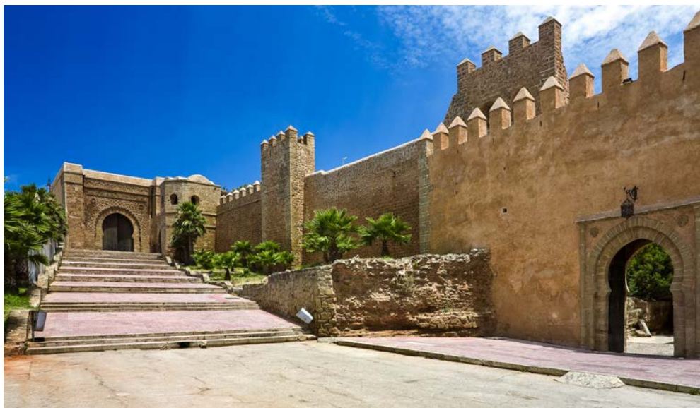
Oudaya Kasbah, Rabat

Checking out of our hotel, we spend the day in Rabat, starting at the Oudaya Kasbah . 'Kasbah' is the Arabic word for fortress, and the Oudaya Kasbah was built in 1672 to protect the city. Once we enter the grounds of the Kasbah, we immediately notice the Andalusian style gardens and the quiet residential areas of white and blue painted houses adorned with flowers. This area is now a haven for artists from all over. We have tea and pastries at Café Maure , overlooking the river. Next, we enter Chellah Necropolis , located on a hilltop above the fertile Bou Regreg River. This is not just a place where we can see centuries-old monuments, but if we listen carefully, it will tell us the tale of the Phoenicians, Carthaginians, Romans, and Arabs who lived here. It is the perfect setting for exploring antiquities, as well as the setting for an annual international jazz festival. We have lunch at Dar Naji Restaurant , where we can taste delicious Moroccan dishes like tagines, dadda salads, couscous with the 7 veggies, and of course, the famous pastilla . Afterward, we go across town to Sidi Bouknadel Exotic Gardens . In 1951, Marcel François, a French horticultural engineer,