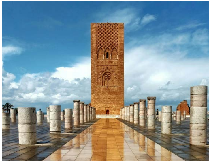
Hassan Tower, Rabat

Our arrival in Rabat is in the early afternoon, in time for a panoramic driving tour on our way to our hotel in the city center. This is the capital of Morocco, filled with domes, minarets, wide avenues and green spaces, along with timeless architectural treasures. This evening we enjoy a get-acquainted dinner at our hotel. Lodging: La Tour Hassan Palace Hotel, Rabat (D)