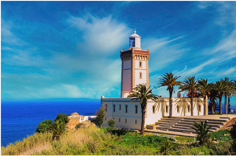
Cap Spartel Lighthouse

follows in one of Tangier's most enchanting gardens, Villa Mabrouka , formerly the secluded sanctuary of fashion legends Yves Saint Laurent and Pierre Bergé. The Villa was later transformed into an elegant hotel by the esteemed British designer, Jasper Conran. In the afternoon, we step into the past, entering Kasbah Palace , also known as Dar Al Makhzan Museum , the Kasbah Museum of Mediterranean Cultures . It is located on one of the highest points of the city overlooking the medina, and the Strait of Gibraltar. Lodging: Barcelo Tangier Hotel (B)(L)