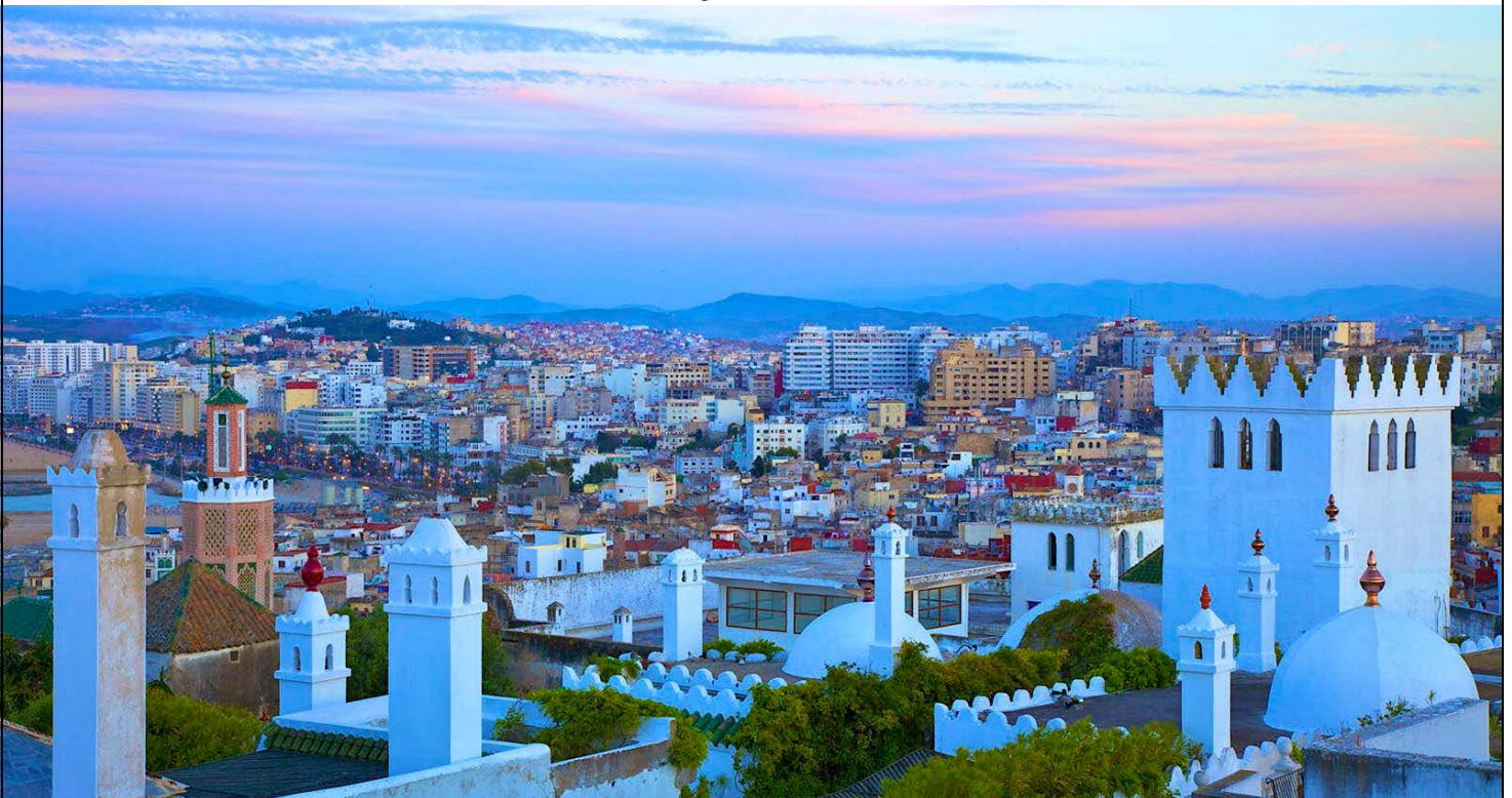
Tangier at sunset