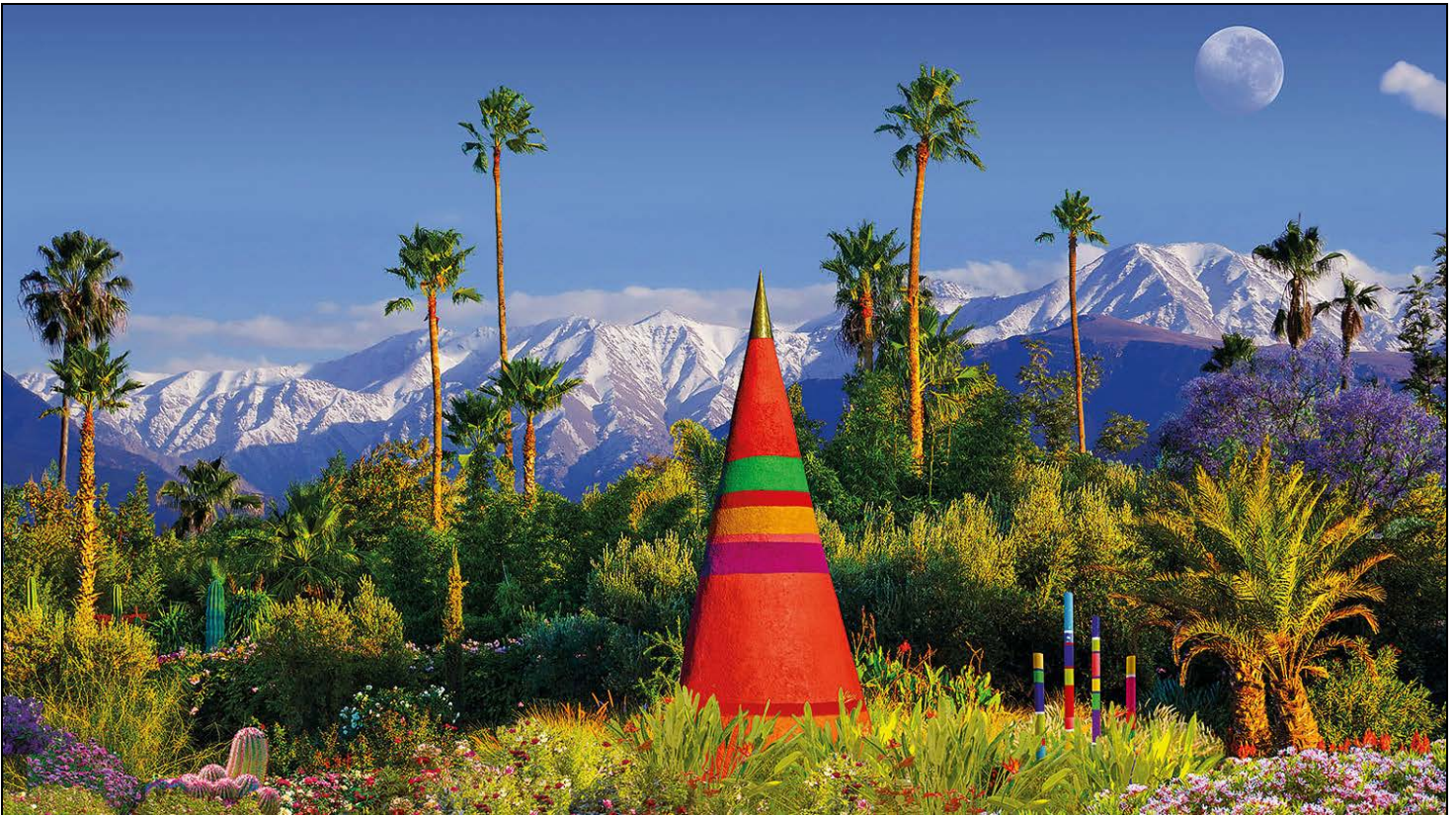
Anima Garden Marrakesh