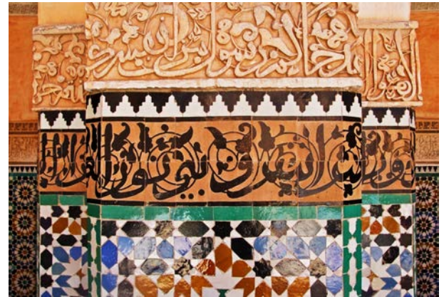
Architectural detailing at Medressa Ben Youssef

Today, we are invited to delve into the soul of Marrakech, exploring its vibrant souks, historical landmarks, secret gardens, and lively squares. From morning to night, each hour offers a new facet of this enchanting city's rich tapestry of culture and heritage. We start with the iconic Jamaa el Fna , as the bustling square comes to life with vibrant energy where performers, musicians, and vendors create a sensory spectacle. We wander into the labyrinth of narrow alleyways in the Souks of Marrakech , filled with a kaleidoscope of goods, from spices to textiles and intricate handicrafts. Nearby, we discover the architectural marvel of Medressa Ben Youssef , an ancient Quranic school that embodies intricate Moorish design of delicate carvings creating a soothing tranquility in the courtyard. In the afternoon, we travel to Dar el Bacha , a historical palace that provides a glimpse into Morocco's opulent past.