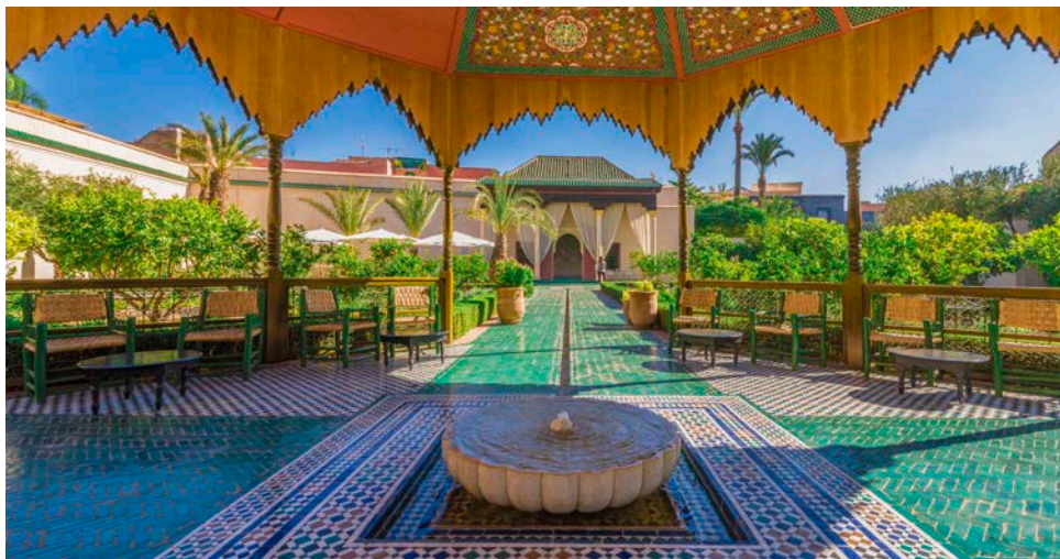
Secret Gardens Marrakech

We admire the detailed architecture and exquisite tilework as each room tells a story of the city's rich history. Later, we escape the hectic city and enter the serenity of the Secret Gardens to discover hidden pathways, tranquil pools, and lush greenery in this oasis of calm. In the afternoon, we visit Arset Moulay Abdessalam , a picturesque square bordered by palm trees