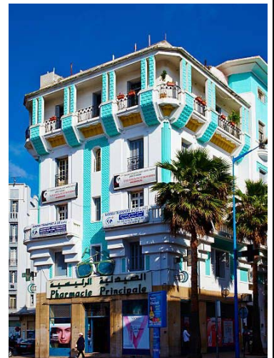
Art Deco District

Today we say goodbye to Marrakech and make our way to Casablanca , arriving in time for lunch in the Art Deco District . The stunning architecture harkens back to the city's cosmopolitan past. The streets are lined with geometric patterns, intricate facades, and elegant balconies that pay homage to a bygone era. We continue on to the majestic Hassan II Mosque , a masterpiece of Islamic architecture with its intricate mosaics and stonework. Then we take our time to meander along La Corniche , Casablanca's picturesque coastal promenade, taking in panoramic views of the Atlantic Ocean. We also take time to discover the trendy Anfa District , where modernity meets tradition, with its upscale boutiques, chic cafes, and dynamic street art that exemplify Casablanca's contemporary urban scene. Finally, we visit the bustling markets into the winding alleys of the Central Market and New Medina . As our afternoon adventure draws to a close, we head to the coast to witness the beautiful sunset. The warm hues of the sky paint a memorable backdrop to the city's silhouette, providing a fitting end to our Moroccan experience. Lodging: Atlas Sky Airport Hotel (B)(D)