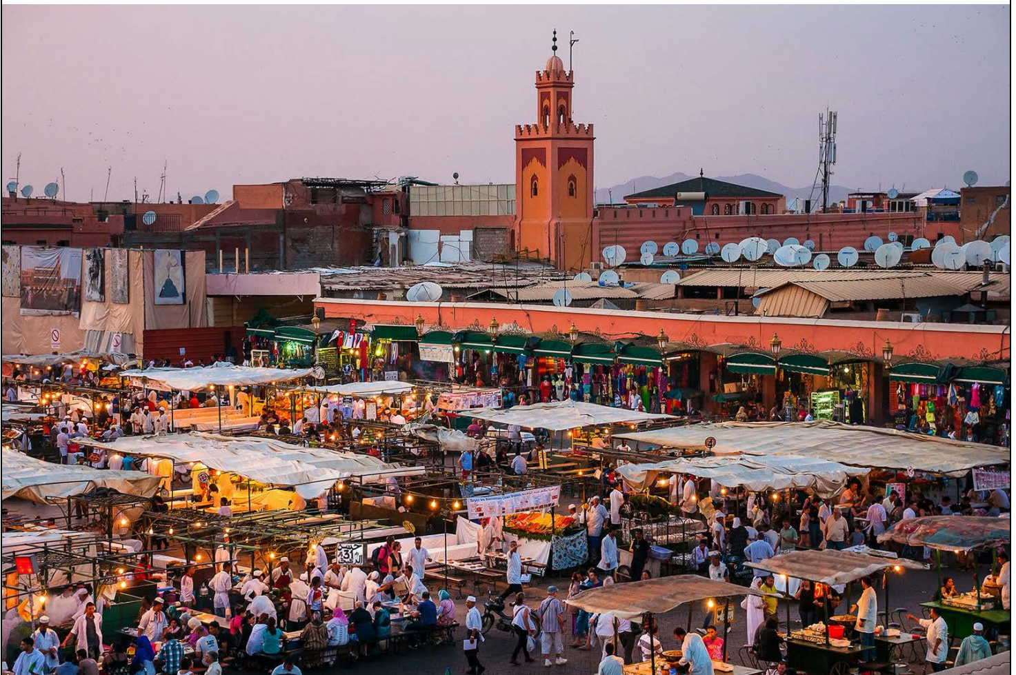
Jamaa el Fna Marketplace Marrakech