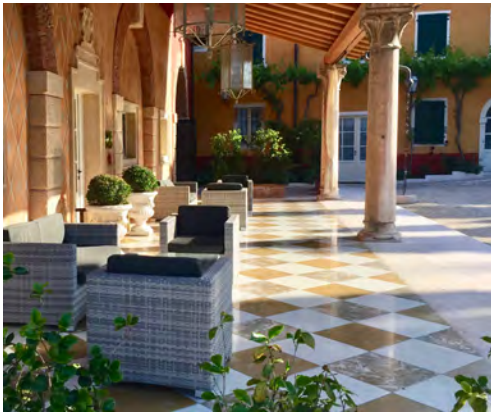
The Restaurant at Villa Cordevigo

delights that we prepared with him. Tonight we enjoy a farewell dinner at a local restaurant. Lodging: Villa Cordevigo Lake Garda (B)(L)(D)