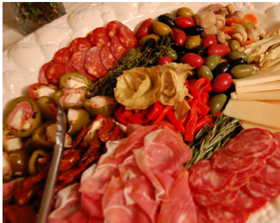
Antipasta in Bologna