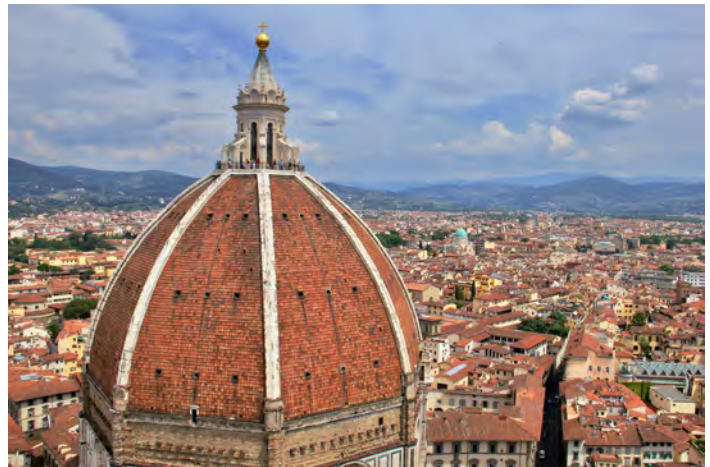
The Duomo in Florence