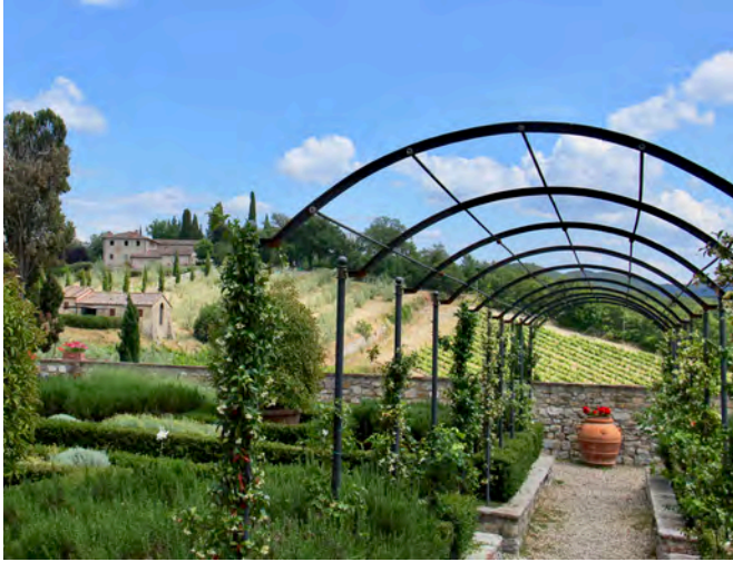
Winery in Tuscany