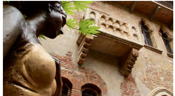
Juliet’s Balcony in Verona