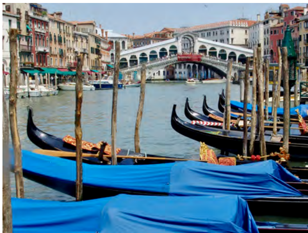
Rialto Bridge on the Grand Canal in Venice

cuts and a variety of cheeses. We continue our walking tour of the city before our mid-afternoon departure. When we arrive in Venice, speedboats whisk us off to our hotel. Our day ends with a walking tour of Venice before dining at a nearby restaurant. Lodging: Hotel Pesaro Palace, Venice (B)(L)(D)