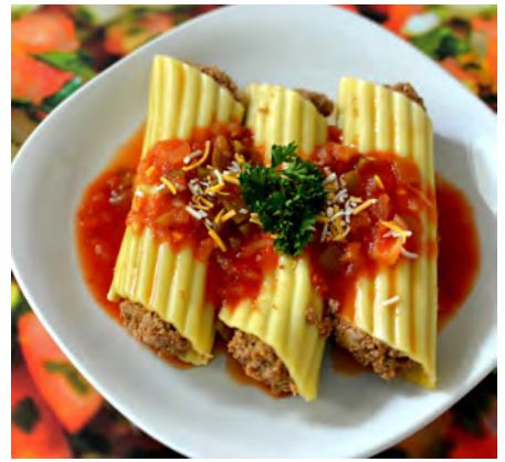
Stuffed Manicotti Pasta