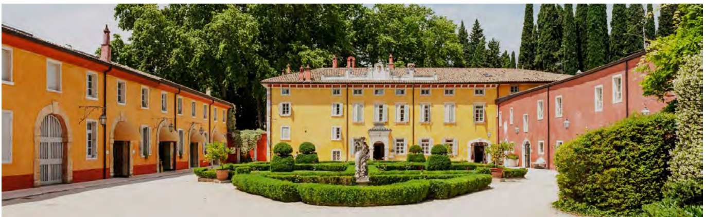
Our final hotel, the Villa Cordevigo Wine Relais, a former monastery