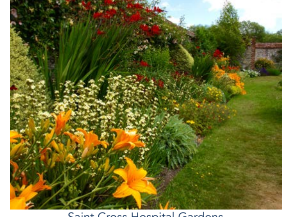
Saint Cross Hospital Gardens

of the old hospital/retreat. Afterward, we walk along a rural path leading to Winchester Cathedral where we have a walking tour. Lodging: Winchester (B)(L)