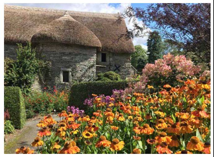
The Garden House

While still in Devon, we stop at Garden House, described by Toby Buckland, of Gardeners' World as "a true plantsman's paradise which holds delights for both the seasoned gardener and for those who simply enjoy exploring and immersing themselves in the beauty and tranquility of 12 acres of stunning gardens." Our introduction to the coastal county of Cornwall is at our next stop, the Village of Polperro. It is one of those quaint, harbor towns where we can leisurely explore the village on our own, and get a snack before departing for our Falmouth resort hotel. Lodging: Falmouth. (B)(L)(D)