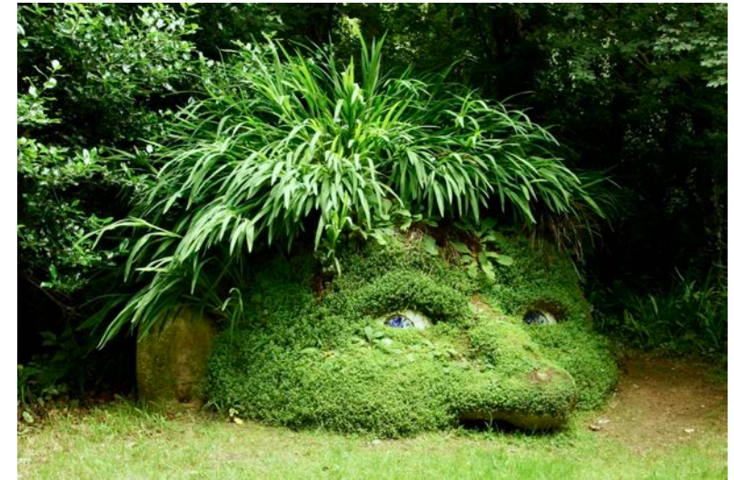
The Lost Gardens of Heligan

Our morning begins with a visit to a garden treasure, long buried and forgotten. The Lost Gardens of Heligan, hailed by The Times as "...the garden restoration of the century," is our sole destination today. We return to our hotel for a free afternoon to enjoy shopping and leisure. Lodging: Falmouth (B)(D)