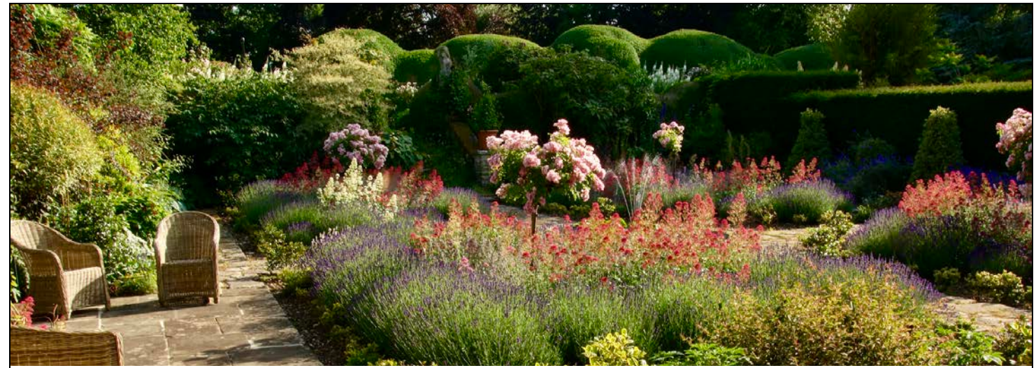
Private Garden near Winchester

garden in the country. Following lunch, we visit another private garden where we have tea in the orangery with time to wander about. This is the setting for many boisterous social gatherings.