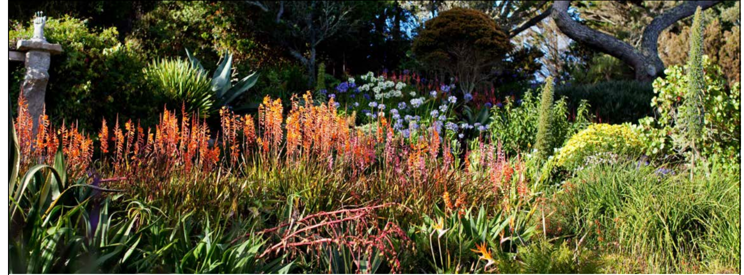
The subtropical paradise known as the Tresco Abbey Garden in the Isles of Scilly