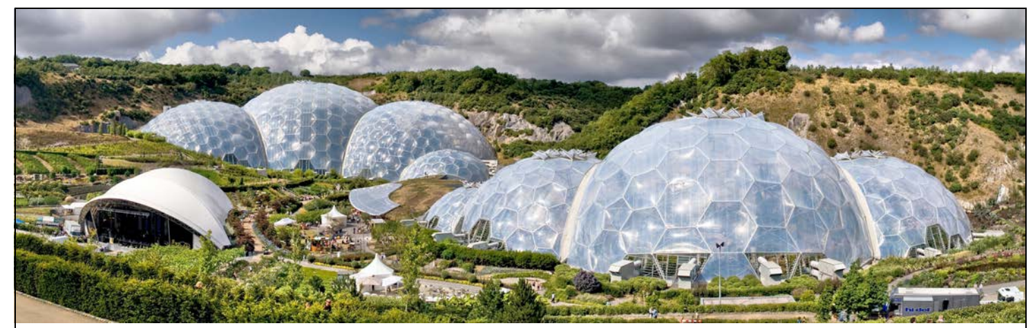
The Eden Project